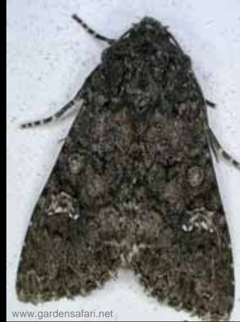
The moth, which is captured in the trap

The CSALOMON ® pheromone trap should be placed in the vicinity of the plant culture to be studied, at the level of the top of the vegetation. It is advantageous to hang the traps from lower