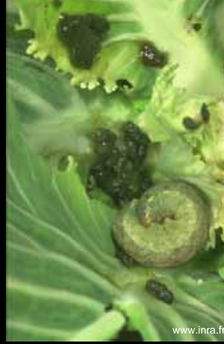
The larva and its damage, which should be averted