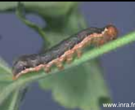
The larva and its damage, which should be averted