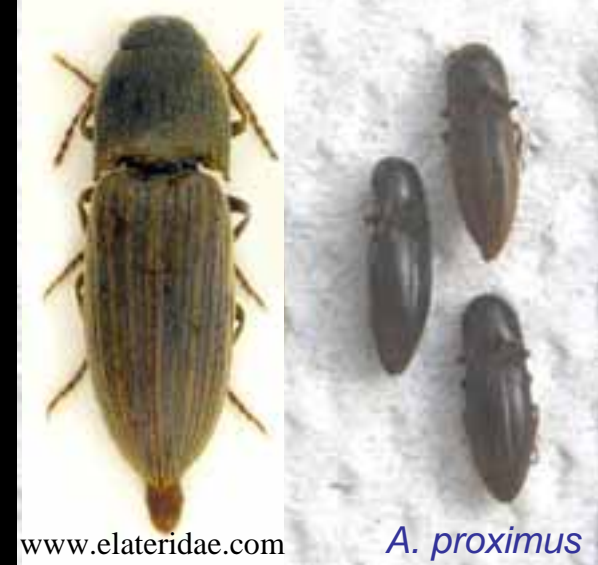
The beetle, which is captured in the trap

Selectivity of the CSALOMON® pheromone trap: the bait attracts equally well also A. lineatus . In tests conducted at several sites in Europe occasionally some specimens of A. obscurus were captured. They are smaller and do not have the "lines" on the elytrae characteristic to A. proximus and A. lineatus .