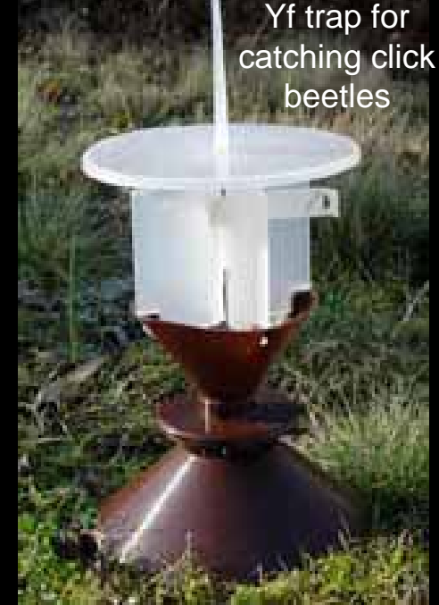
Yf trap for catching click beetles

The non-sticky trap types are capable of catching very large numbers of beetles without being saturated. Detailed measurements for A. proximus are not yet available. According to experience in Italy on the closely related A. ustulatus , if the average catch per trap does not exceed 150-200 specimens per year, damage is highly improbable on the given field [1] . In case of higher captures, it is advisable to perform larval sampling (soil cores) for more accurate estimation of population levels. If protection is necessary, it may be performed through agrotechnical means, crop rotation or in more severe cases by soil insecticides [2] . More accurate establishment of correlations between trap captures and larval density in different cultures are underway (Lorenzo Furlan, pers. comm.)