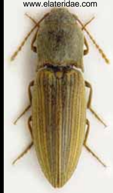
The beetle, which is captured in the trap

Host plants of the larva include maize, cereals, sunflower, sugar-beet, potatoes, other grasses and also many other plants, i.e. tomatoes. The larvae feed on the roots. The adult beetle feeds on leaves of grasses and on flowers by pollen; it can frequently be seen for example on Umbelliferae flowers. The main damage is caused by the larvae, the wireworms, which eats up hatching seeds and roots inside the soil. Damages are variable depending on the plant species attacked and the type of soil. Indicators can be of imperfect hatching of seedlings (maize), damaged hatchlings and roots, yellow colouring of the plant parts above ground.